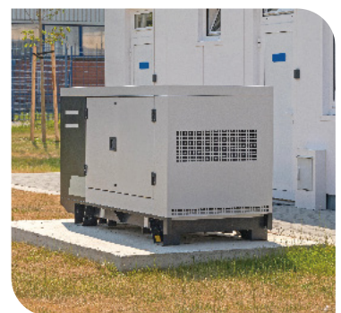
Rental & Leasing