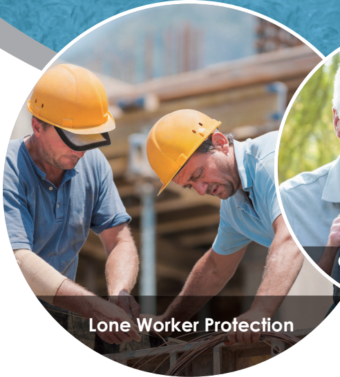
Lone Worker Protection