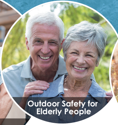
Outdoor Safety for Elderly People